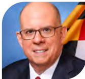
Governor Larry Hogan of Maryland 2022 ARC States' Co-Chair