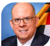
Governor Larry Hogan of Maryland 2022 ARC States' Co-Chair

Join ARC 2022 States' Co-Chair Governor Larry Hogan of Maryland and special guest/MLB Hall of Famer Cal Ripken Jr. for an exclusive fireside chat. Cal Ripken Jr., a Maryland native, will share rare insights from the start of his baseball career with the minor league Bluefield Orioles in the Appalachian League to becoming a renowned major league hall of fame inductee with the Baltimore Orioles. His legacy of commitment and steadfast determination, both on and off the field, will resonate with Appalachians working to improve their communities every day.