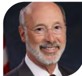
Governor Tom Wolf of Pennsylvania