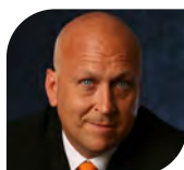
Cal Ripken Jr. MLB Hall of Fame Inductee